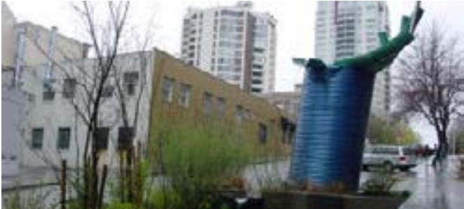
Beckoning Cistern above cascading gardens on Vine Street.